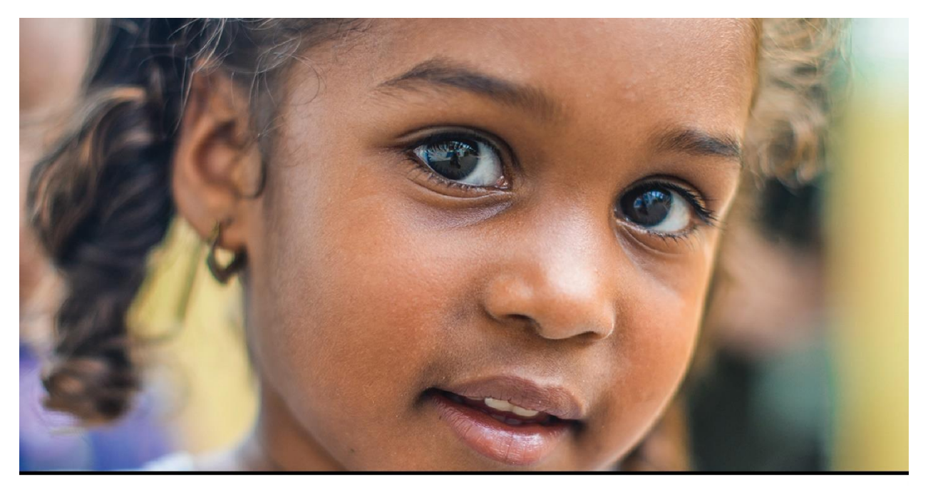
Guaranteeing a Lead Free Future for Our Children